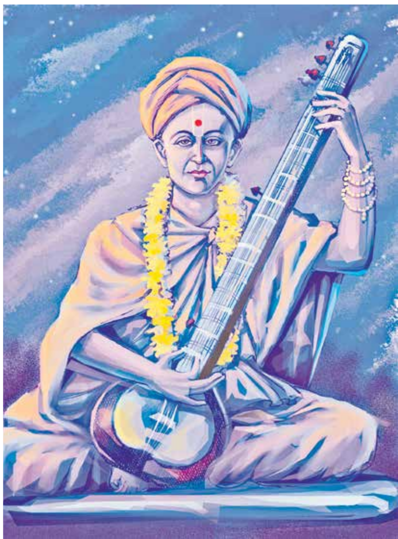
Sadguru Devanand Swami