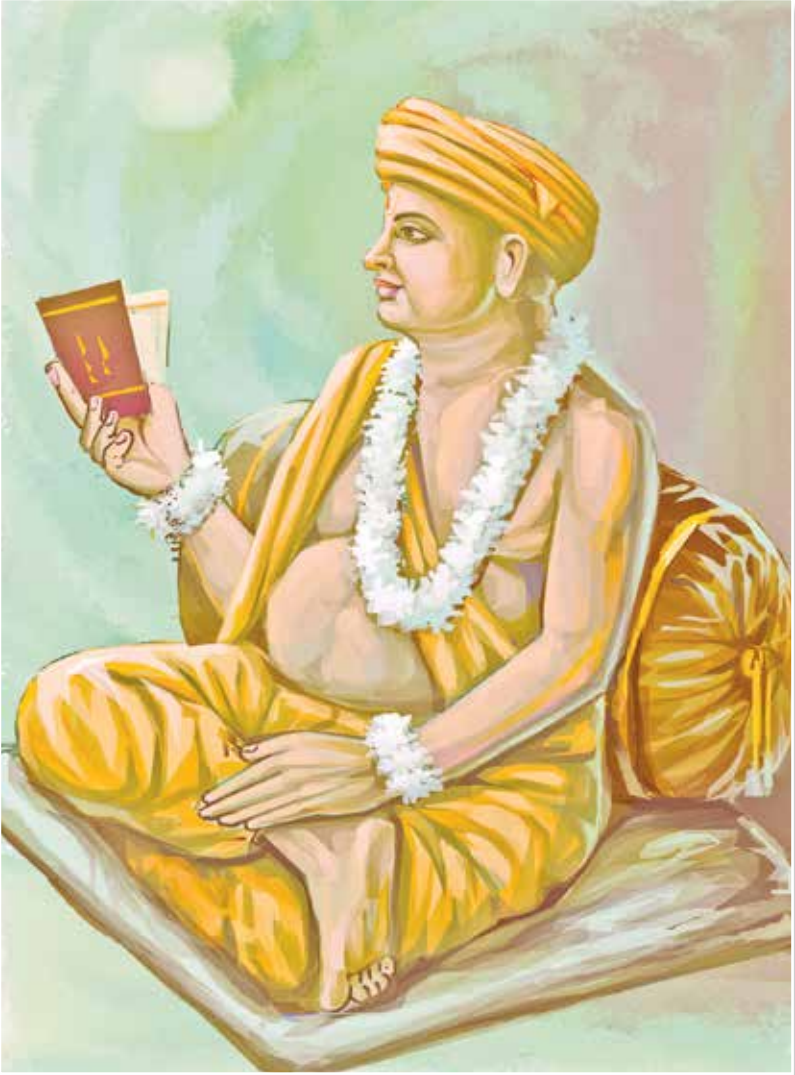
Sadguru Brahmanand Swami