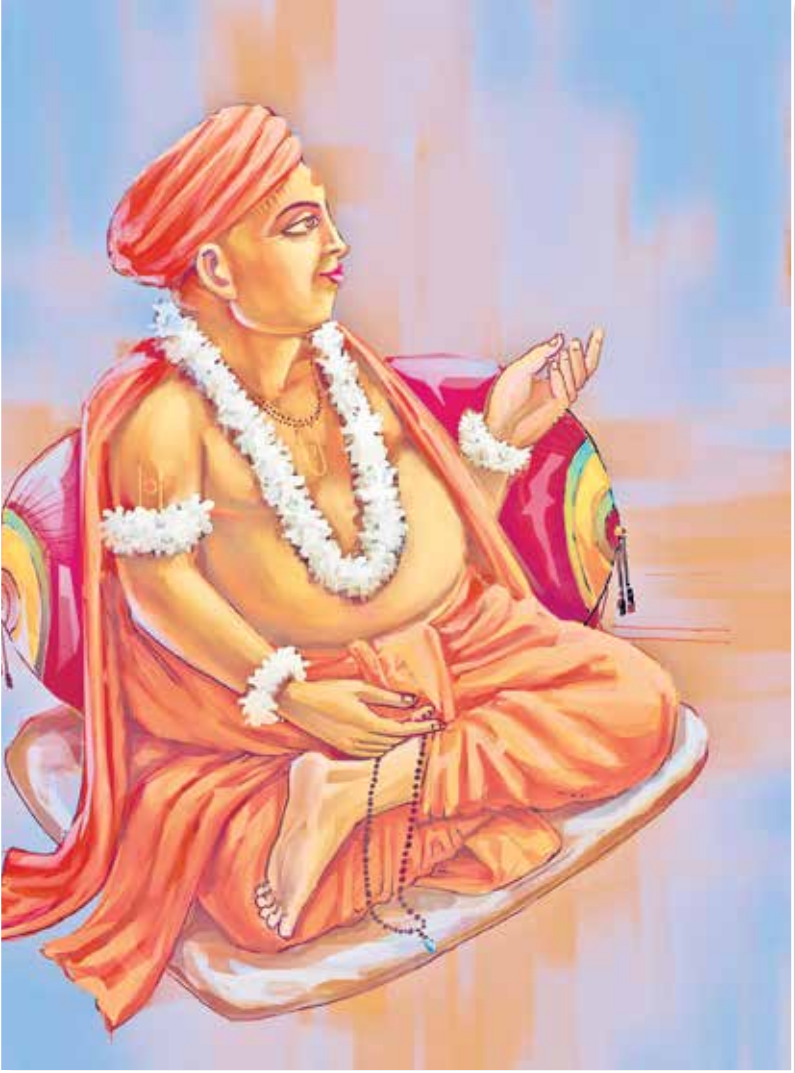
Sadguru Shukanand Swami