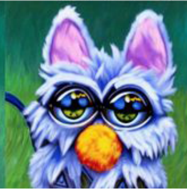
high quality, painting by vincent van gogh, hyper detailed, a cute foorbyv1