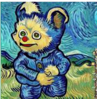
high quality, a cute foorbyv1, hyper detailed, painting by vincent van gogh