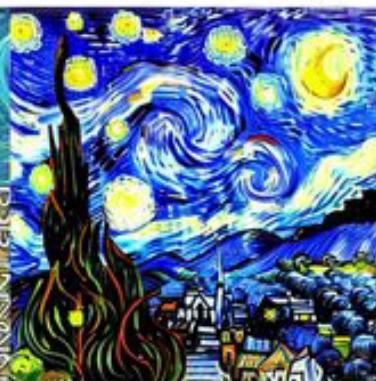
high quality, hyper detailed, painting by vincent van gogh, a cute foorbyv1