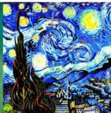
hyper detailed, painting by vincent van gogh, high quality, a cute foorbyv1