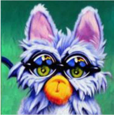
high quality, painting by vincent van gogh, a cute foorbyv1, hyper detailed