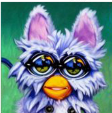
hyper detailed, painting by vincent van gogh, a cute foorbyv1, high quality