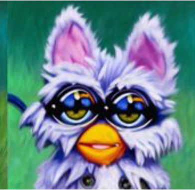
high quality, a cute foorbyv1, painting by vincent van gogh, hyper detailed