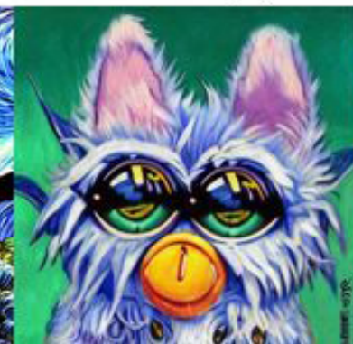
hyper detailed, a cute foorbyv1, painting by vincent van gogh, high quality