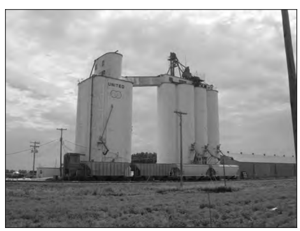
Grain Elevator, Hordville (HM04-023).