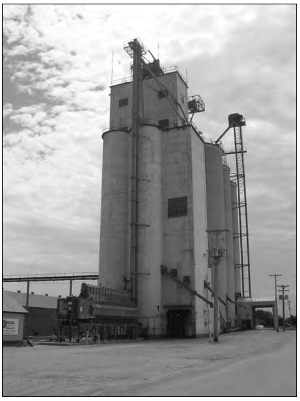
Grain Elevator, Marquette (HM06-032).