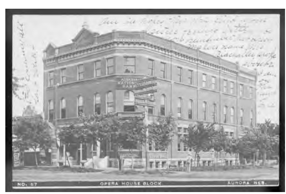
Aurora Opera House.

Two years later (1879) the Burlington and Missouri Railroad came to town, which proved to be a major turning point in the community's history. The Burlington and Missouri River Railroad had announced plans for a line from York on west through Aurora and Hamilton County. The stipulation was that the town had to provide $72,000 for the project ($48,000 of which was due when the line reached Aurora). A vote to raise the bond was held and of the 1,194 votes cast, 956 were in favor and only 238 opposed. As a result of the overwhelming support, the railroad lowered the bond amount to $50,000.65 Soon Aurora was connected to other cities via rail and telegraph lines. When the railroad "ran its first regular train into the town October 14, 1879, a great forward stride was made, and a period of activity ensued which rapidly carried the town into rank with her neighbors in surrounding counties."66 Within a decade the railroad had extended lines from Aurora west to Grand Island (1884) and north to Central City (1886).<sup>67</sup>