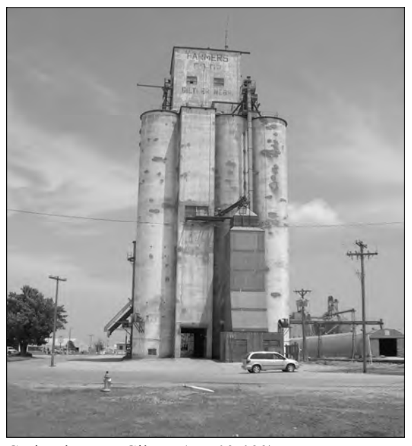
Grain Elevator, Giltner (HM02-023).

(1910), Hampton (1910), and Giltner (1915). In 1921, Burr and Buck (1921) claim that "Hamilton is the only county in Nebraska, or probably in any other state, that has a farmers' elevator at every railroad station."<sup>50</sup> Today, grain elevators in Hamilton County's communities can be seen for miles away, are the largest structures, and serve as one of each town's focal points (HM02-020, HM04-023, and HM06-032).