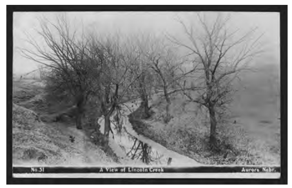
Lincoln Creek, Aurora.

and headed west. Coming to a point on Lincoln Creek where two cottonwood trees stood like "sentinels on the banks" they choose the site for what would become Aurora. Today this location is part of Streeter Park (HM01-243).