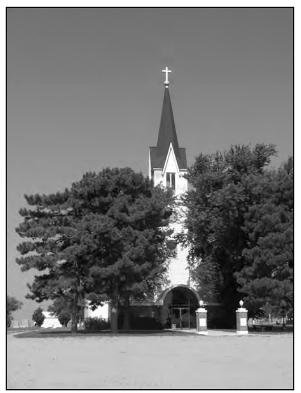
Zion Lutheran Church (HM00-045).

of the church was altered in 1972 when a new foyer was added, but the interior retains much of its original character. A large U-shaped balcony wraps around three sides of the nave and pressed tin is found throughout the building.