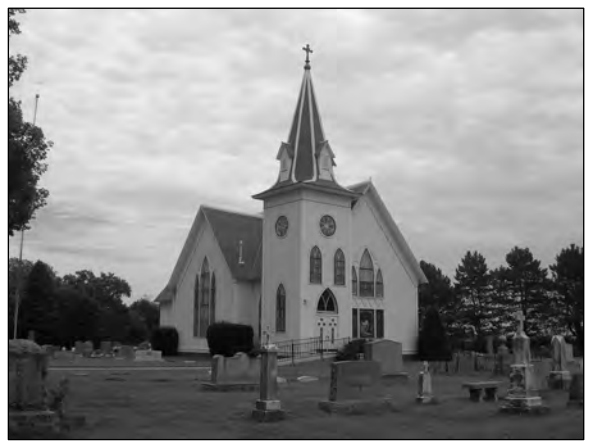
St. John's Lutheran Church, Kronborg (HM05-001).

Also in northeastern Hamilton County is the Zion Lutheran Church and School (HM00-045). Similar to other rural churches, Zion Lutheran has been the focal point of the surrounding German settlement for decades and is a noteworthy structure. The area was settled by Germans and the first church was erected in 1877. This church was replaced in 1885 with another structure which burned in 1896.<sup>31</sup> The present Zion Lutheran Church was dedicated in 1897 and is part of a rural religious complex, which includes a cemetery, church, parsonage, and school. The exterior