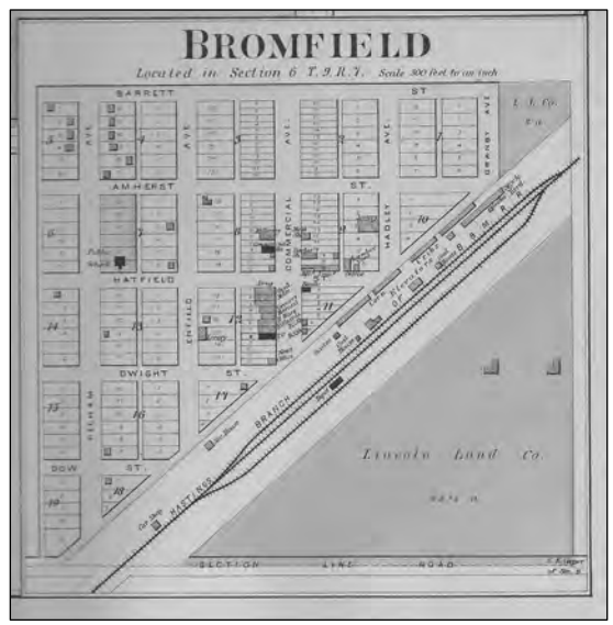
Bromfield, Nebraska's "T-Town" Plat (Dunham 1888).

In regard to population, Hamilton County's towns have demonstrated a number of trends (Table 3). Five of the seven rural communities peaked in population between 1900 and 1940, which is typical of most small towns in the Midwest and Great Plains. However, four of those