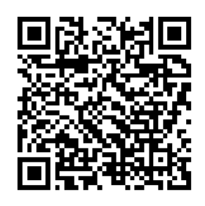
DOI: dx.doi.org/10.17504/protocol s.io.5qpvobjmdl4o/v1