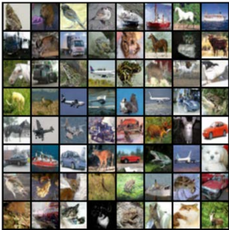
Residual U-Net (35.5 M Parameters)